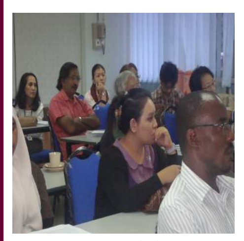
Participants at the lecture