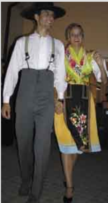
The bridegroom and bride in their traditional Portuguese and Slovak costumes

The character of Slovaks is something between Portuguese and Germans. People in Slovakia are very nice but not as nice and relaxed as Portuguese and are quiet organized and systematic but not as well as Germans.