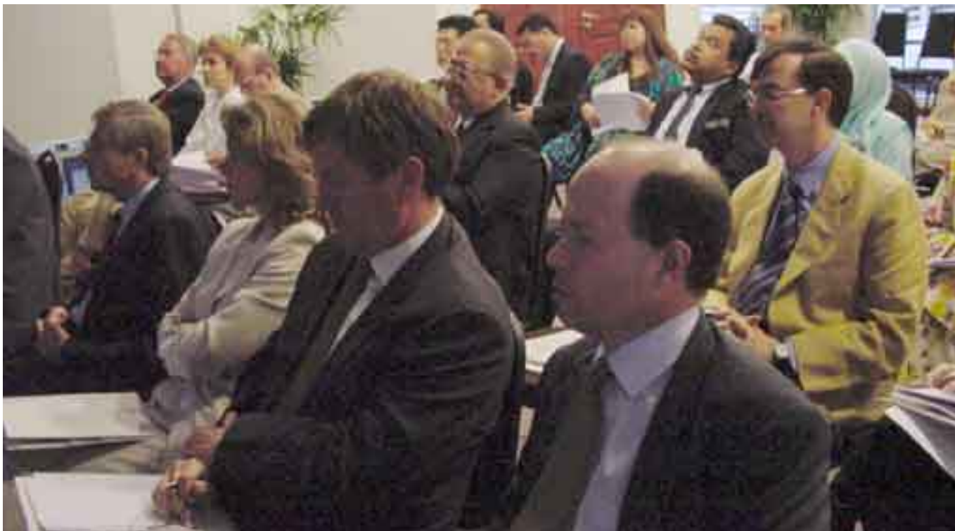
Part of the audience during the briefing