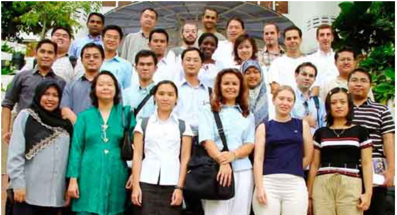
Master Degree Programme students at AEI