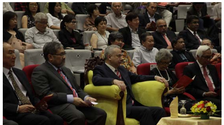
DYMM Sultan Nazrin Shah and the invited guests during the lecture