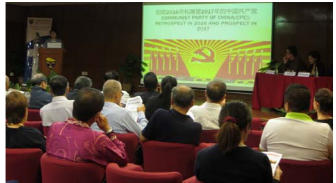
The number of participants was overwhelming in the forum