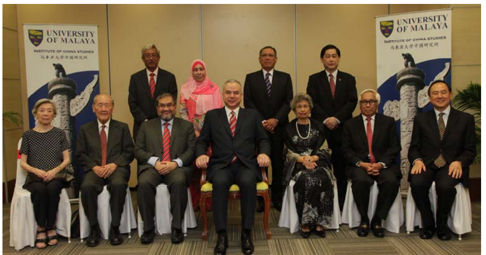
Tuanku Canselor of University of Malaya, DYMM Sultan Nazrin Shah with Professor Wang Gungwu and the invited guests.