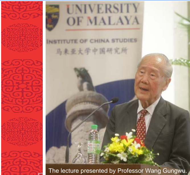
The lecture presented by Professor Wang Gungwu.