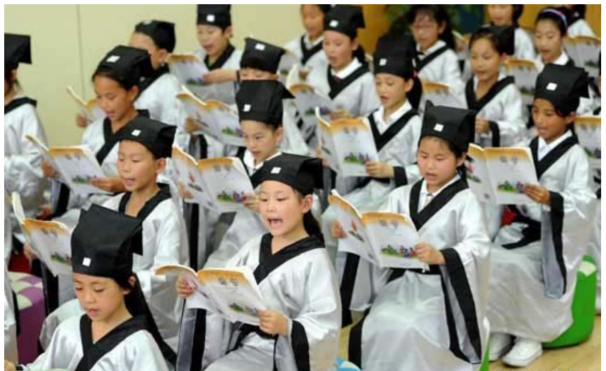
Revival of Confucianism starts at the youngest level

Among Among the lot, the indigenous "Chinese Religion" is the fastest growing and within this group, the mainly philosophical, pseudo-religious Confucianism received the strongest state endorsement. Beijing is increasingly returning to Confucian ideals such as "harmonious co-existence" (和谐共处) and "benevolent