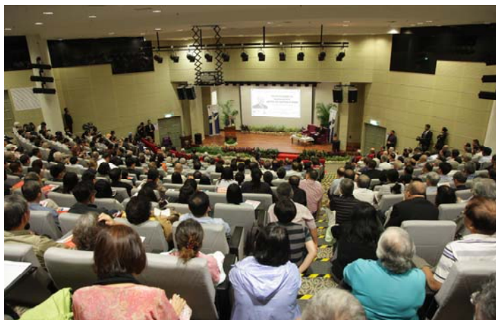
The number of participants was overwhelming in the public lecture

European nation-state and responded well to the challenges, including building its naval power, army, and the capitalist economic system. Japan was also the first Asian country to understand how to use the international legal system to benefit itself and undermine the Sino-centric tributary system.