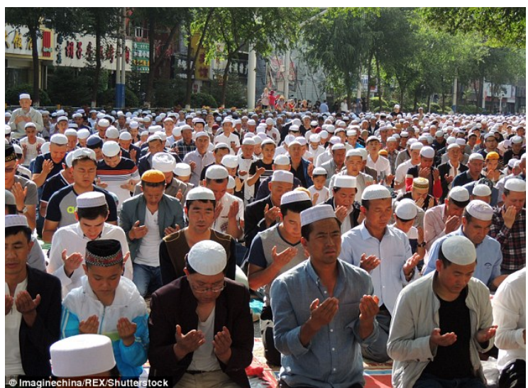
Muslims worship in China

Challenges continue to beset Chinese religiosities, to be sure, as the state seeks to reconcile the perennial tension between order and freedom. Even so, the general outlook is one of anticipation, of more progress over regress in 2017, and the years to come .