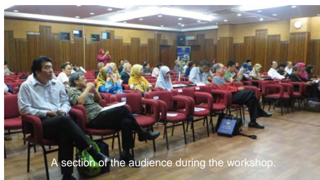
A section of the audience during the workshop.