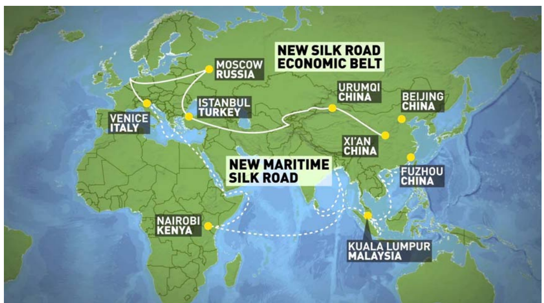
China's Belt and Road Initiative

This grand vision may be seen as the magnification and internationalization of Xi Jinping's China Dream into the Asian Dream. To be sure this is as much a dispensation of Chinese soft power as it is a projection of geopolitical sway, to restore China's regional if not global preeminence.