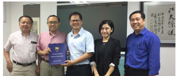
Delegation of University of Macau.