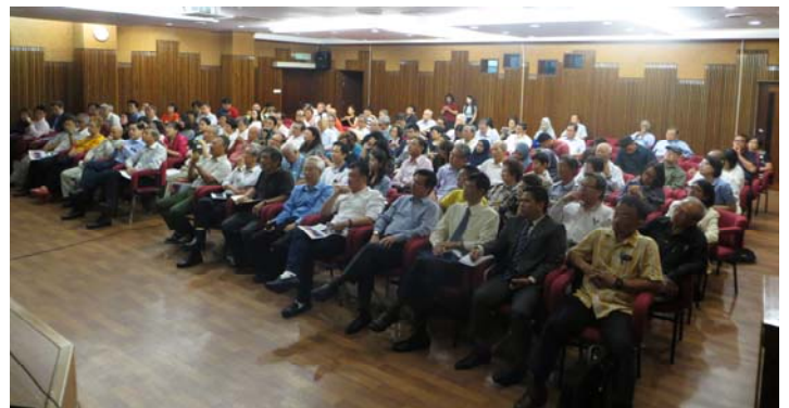
Section of audience during the public lecture.

Institute of China Studies had the honour of inviting Professor Martin Jacques, the author of acclaimed book When China Rules the World to present a public lecture at ICS on 7 November 2016. Prof. Jacques is at present affiliated with the Department of Politics and International Studies, Cambridge University, the Department of International Relations, Tsinghua University, and the Lee Kuan Yew School of Public Policy at the National University of Singapore. According to Professor Jacques, China has confounded the doubters and critics and succeeded, quite remarkably, in meeting projections which were seen as overly optimistic. In 2014, according to the IMF, it became the world's largest economy measured by ppp. But what of the future? Professor Jacques discussed how China has to shift the basic paradigm of its economy if it is to avoid getting stuck, and how under Xi Jinping, its ambition is not just to be an economic power but also a political, cultural and military power. If it is successful in these objectives then by 2030 the world will look very different and China will have become the world's predominant power. ♦