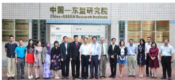
Delegation from University of Malaya with all the speakers in China-ASEAN Research Institute (CARI), Guangxi University, China