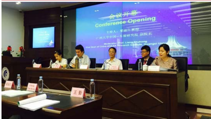
Opening Ceremony during the International Workshop.