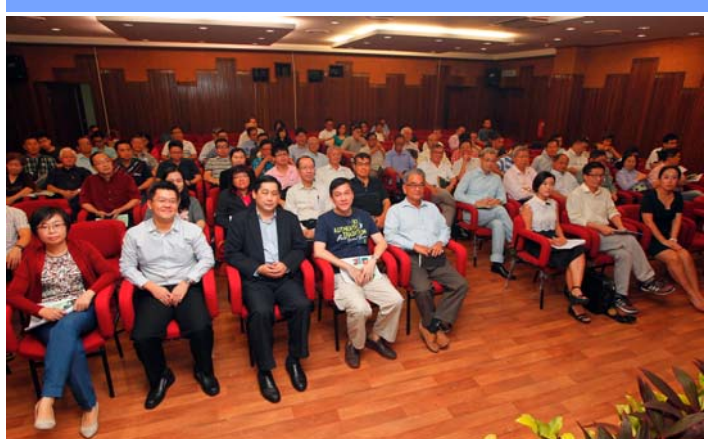
Packed audience for the ICS Forum: China Review 2016"