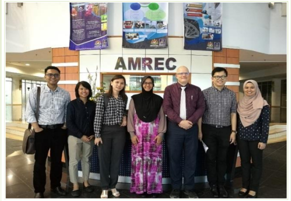
Advanced Materials Research Centre (AMREC)