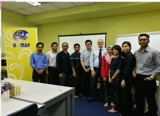
School of Materials Engineering, UniMAP

CAM members had organized a research trip to the Northern side of the country. Some places we managed to visit were UniMAP, USM, INFORMM and AMREC. This visit was aimed to explore potential collaborations with other local universities and research centres. The visit also facilities and equipment of laboratory / research centre and to build research collaboration in materials & mechanical engineering field.