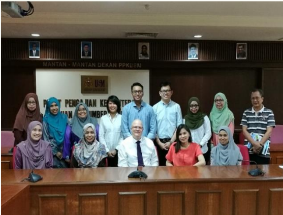
School of Materials & Mineral Resources Engineering (USM)