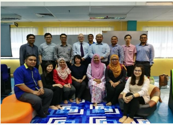
School of Manufacturing Engineering, UniMAP