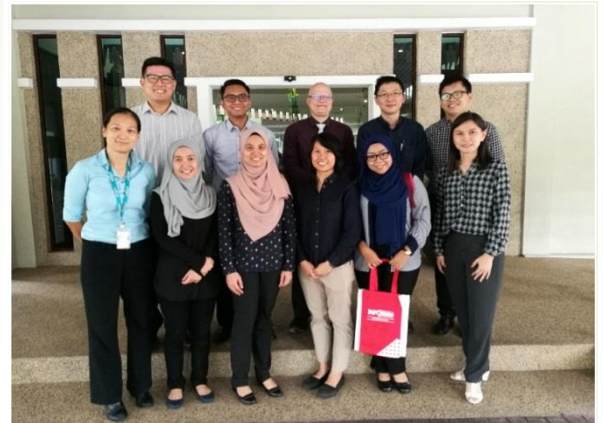
Institute for Research in Molecular Medicine (INFORMM)