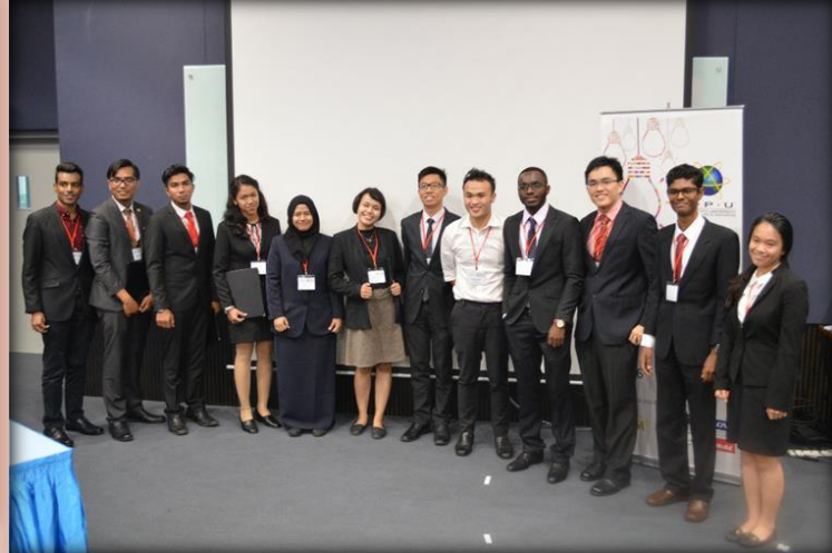
Semi-finalists of MLC2017.