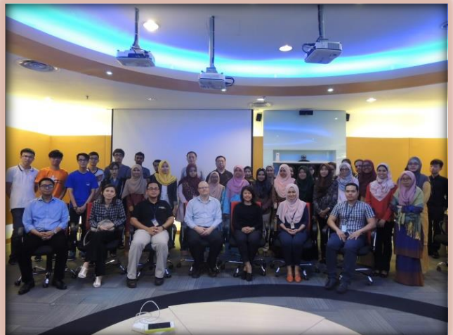
A group photo of CAM Symposium. A line of judges in front, followed by the CAM members, winners, participants audience and helpers.