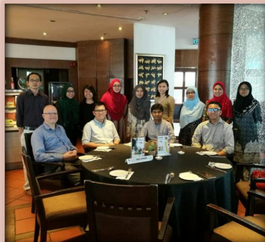
A photo of CAM members during the farewell party