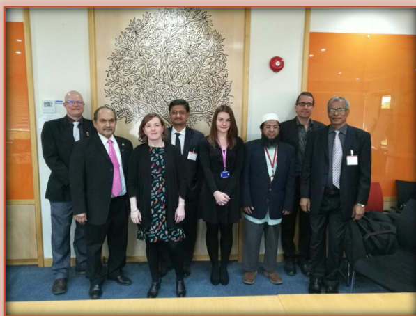
A photo of editors-in-chief for the encyclopedia .