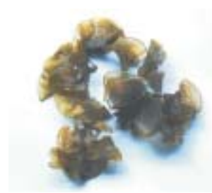
The marine organisms collected for the research. From the left are: the soft coral, marine sponges and seaweeds