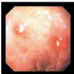
Asymptomatic iron-deficiency anemia, consistent with a low grade malignant lymphoma of mucosa-associated lymphoid tissue (MALT).

Histology on the resected specimen was consistent with a low grade B cell malignant lymphoma of the mucosa associated lymphoid tissue (MALT) type.