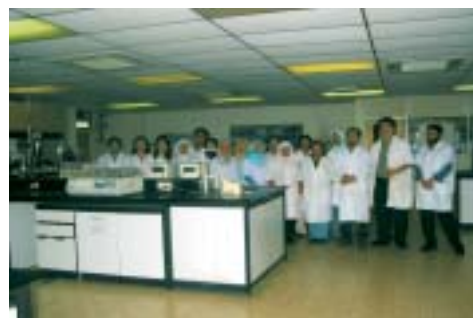
THE COMBICAT TEAM