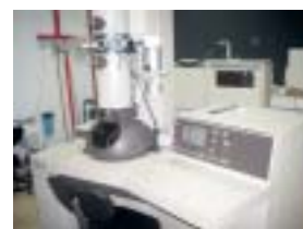
Transmission Electron Microscope