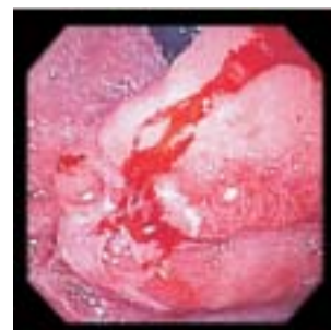
Gastric fundic tumor, the lesion was focally ulcerated and bleeding. Histology was consistent with a large B-cell lymphoma or MALT.