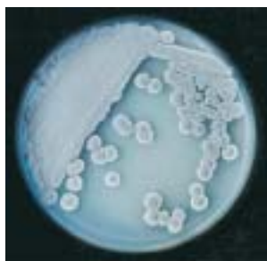
Actinomycetes that lives in the coral reef sponges

The research was funded by a short-term research grant from the University of Malaya and is currently being funded by the Malaysia Toray Science Foundation (MTSF) Science & Technology Research Grant.