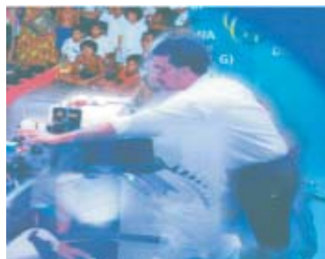
THE PLANAR WAVEGUIDE PROJECT