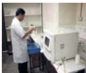
Total Organic Carbon Analyser