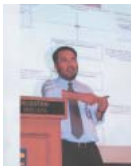
Any problem with e-irpa, I'm the man to see

The series of IRPA Talks and Workshops rolled off to a good start with the one held by the Faculty of Engineering from 18 – 20 June 2004. This session was held in the greenery and cold ambience of Awana Golf and Country Resort in Genting Highlands, which was very conducive for encouraging interest and motivation. The Faculty of Engineering through its own effort managed to attract many of their researchers. The objective of this workshop was attained as 20 IRPA proposals were submitted to the Director of IPPP at the end of the workshop.