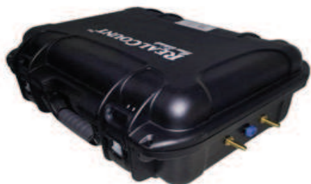
Figure 1: RealCount™ Automated Traffic Classifier console

Traffic data is important in transport planning, traffic impact assessment, any planning and design of transport facilities and road networks. It is a compulsory input for carrying out traffic impact studies for any new land use development such as residential, commercial, mixed development areas and townships. This opens the door for invention of an accurate and comprehensive traffic data tool. The invention called The RealCount™ Automated Traffic Classifier (RealCount™ ATC) (Figure 1). It is the only automated traffic classifier that can provide individual vehicular data and traffic without any estimation. The system is also capable of isolating each vehicle within a traffic platoon and can classify the vehicles according to number of axles and wheelbase. It is classified under intrusive multiple technology as the detectors and road sensors are installed on the road using a special road tape with minimum to no damage to the road (Figure 2). As many other research projects, the invention underwent many challenges from preliminary design, hardware and software development and improvement, functional testing and product enhancement for commercial purposes.