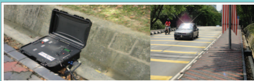
Figure 2: RealCount™ ATC installed on the road

Traffic data is important in transport planning, traffic impact assessment, any planning and design of transport facilities and road networks. It is a compulsory input for carrying out traffic impact studies for any new land use development such as residential, commercial, mixed development areas and townships. This opens the door for invention of an accurate and comprehensive traffic data tool. The invention called The RealCount™ Automated Traffic Classifier (RealCount™ ATC) (Figure 1). It is the only automated traffic classifier that can provide individual vehicular data and traffic without any estimation. The system is also capable of isolating each vehicle within a traffic platoon and can classify the vehicles according to number of axles and wheelbase. It is classified under intrusive multiple technology as the detectors and road sensors are installed on the road using a special road tape with minimum to no damage to the road (Figure 2). As many other research projects, the invention underwent many challenges from preliminary design, hardware and software development and improvement, functional testing and product enhancement for commercial purposes.